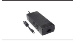
Power Supply Unit (PSU)