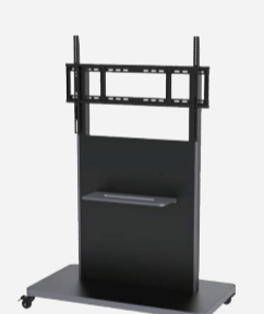
Mobile Stand (ST23C)