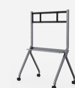
Mobile Stand (ST41B)