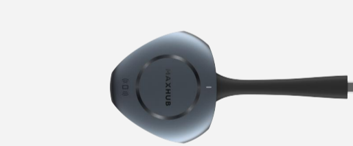
Wireless Dongle (WT13)