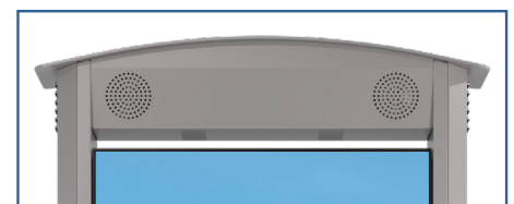
KOP55XHB(-S)A-EUK Includes (2) Speakers