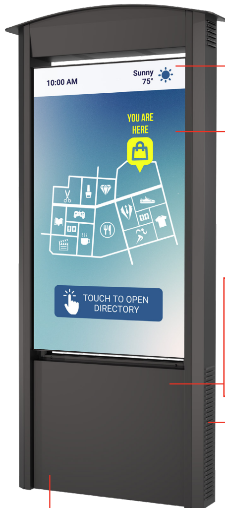
Model Shown: KOP55XHB-EUK

Upgrade your current signage with a brand new Peerless-AV® Smart City Kiosk. This next generation Smart City Kiosk will allow you to replace dynamic, digital content quickly, easily, and remotely, drawing in more engagement than your previous static signage. By combining a sleek, modern aesthetic with an approachable and easy-to-use design, the Smart City Kiosk puts functionality at the forefront. A 10-point IR touch overlay can also be added for an interactive customer experience. Outdoor elements are no match for this kiosk because it is all-weather rated, highly durable, and built to last. Maintenance and installation are also simplified with no cranes or forklifts needed and secure rear doors that allow quick access to the display for maintenance purposes. The Smart City Kiosk comes packed with ample component storage and a 55" Xtreme™ High Bright Outdoor Display with full HD1080p resolution. Even when placed in direct sunlight, you are guaranteed a bright and crisp picture when sharing digital signage content - Whether that is focused on travel, wayfinding, advertising, weather, entertainment, and more.