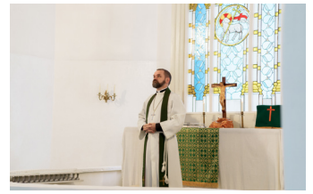
Houses of Worship