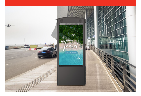
All Weather Rated Display: IP66